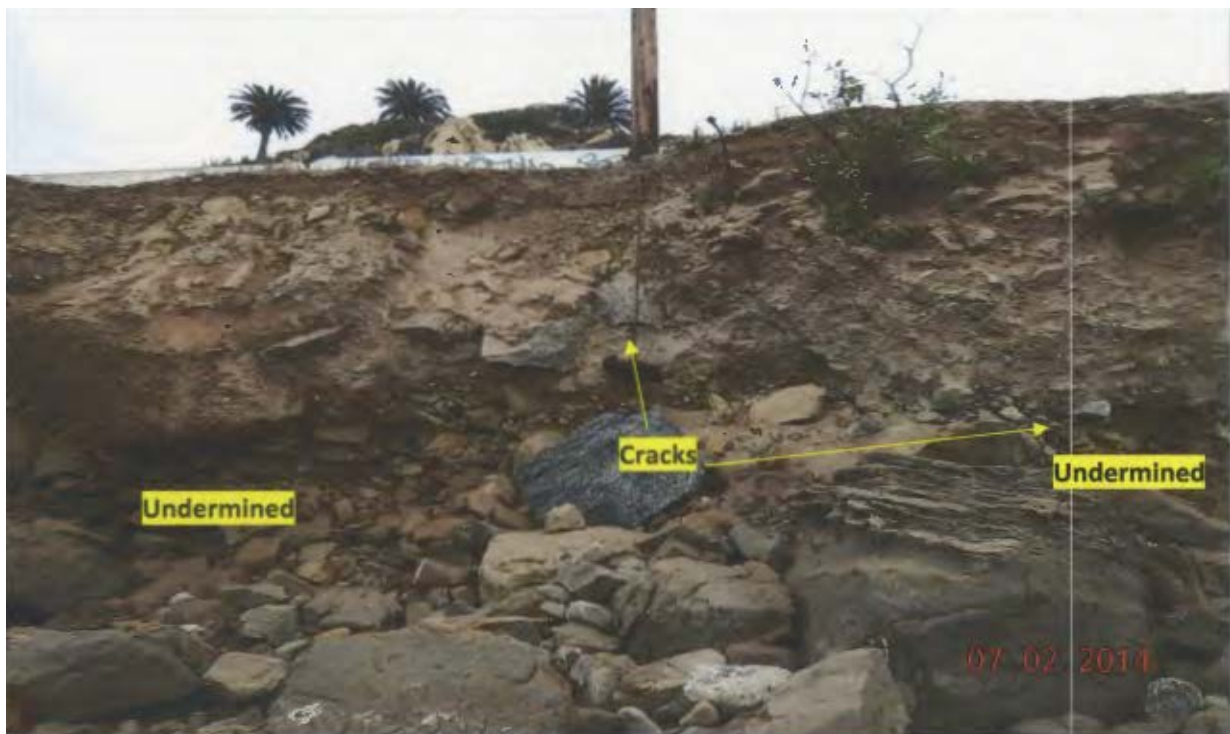
Photos taken in July 2014 after Hurricane Marie