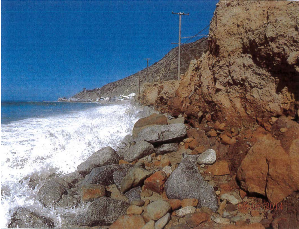
Site view - remnants of previous RSP (from 1950) visibly being impacted by wave surge