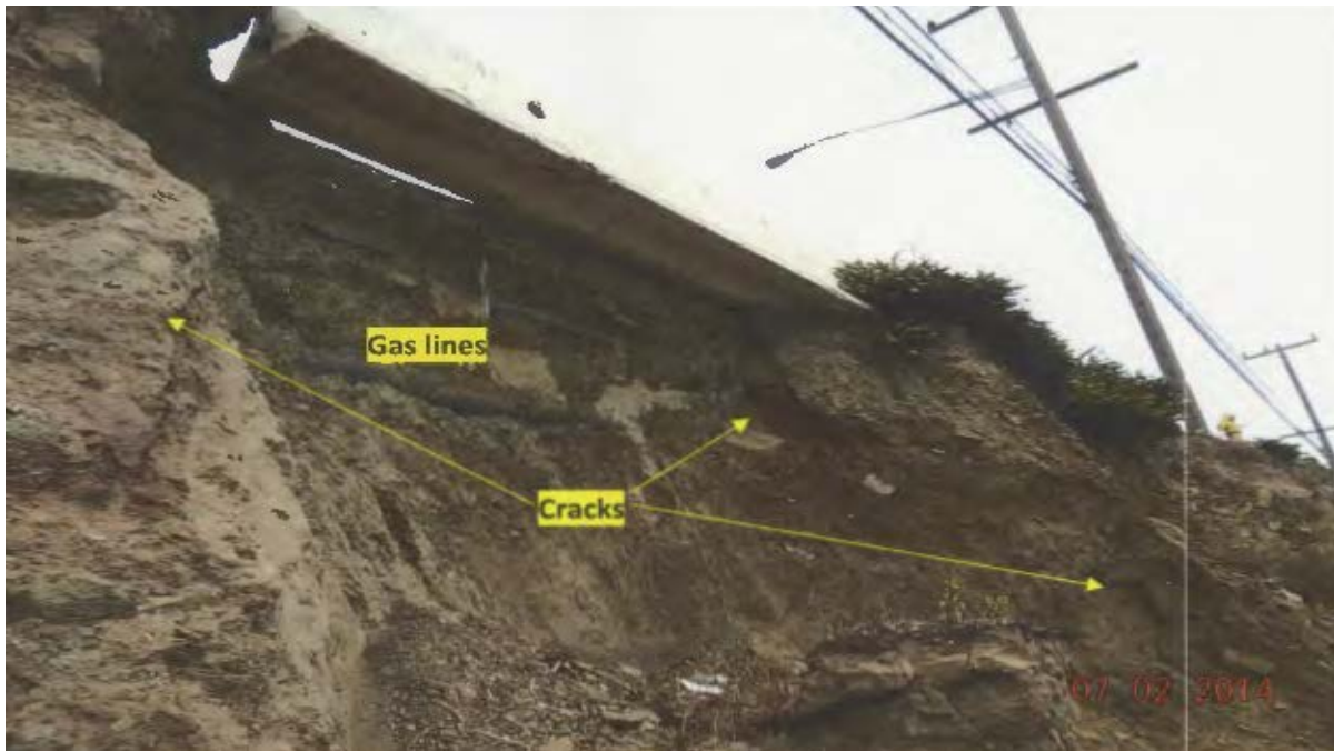
Exposed gas line, undermined K-rail (can actually see inner edge of K-rail day lighting)